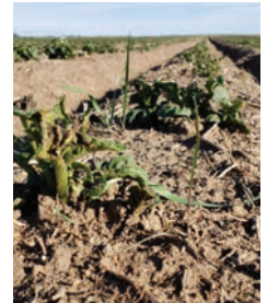
These photos are from the grower's standard side.